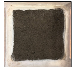
Maintenance: Before (top) & After (bottom)